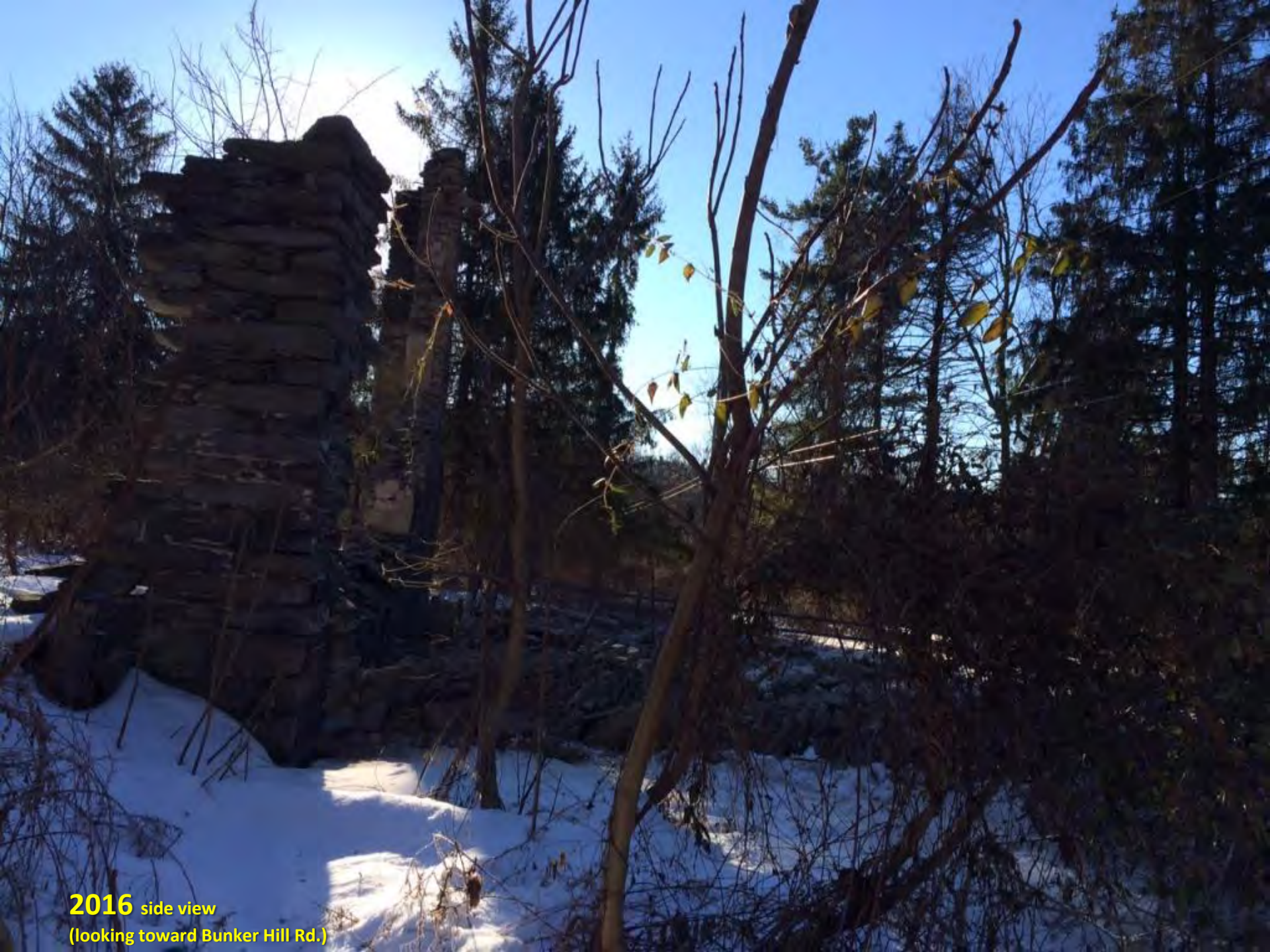
2016 side view (looking toward Bunker Hill Rd.)