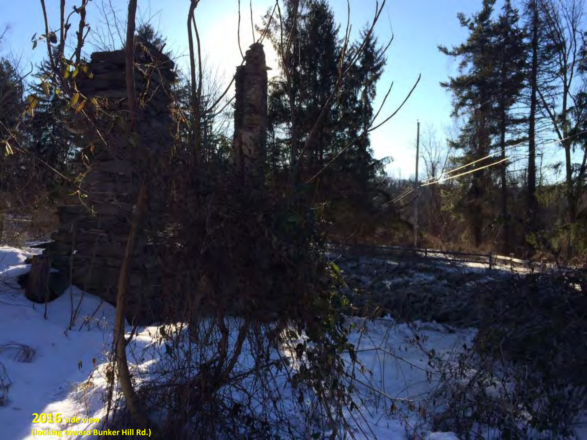
2016 side view (looking toward Bunker Hill Rd.)